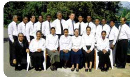
Missionary students in Dominican Republic