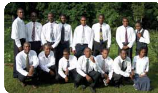
Missionary students in Haiti