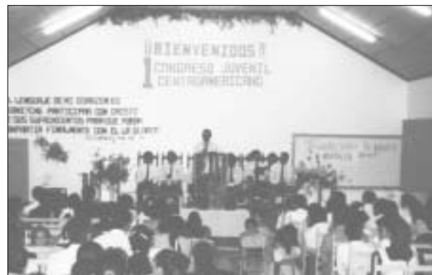
First youth convention of Central America

In the coastal city of La Ceiba, Honduras, C. A., the first Youth Convention in Central America was held from April 6–11, 1998. Young people came from Belize, Guatemala, El Salvador, Nicaragua, Costa Rica, and Honduras. The young people gathered were about 80% of the attendees. On the last day of the convention, about 400 people were present. One of the many happy events of this youth gathering was the baptism of 20 souls—most of them young people.