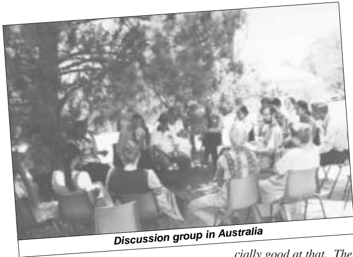
Discussion group in Australia

journey that would last three months. I left home on January 9, 1998. The first stop was Tahiti. If you ever wish to experience warmth and true welcome by people, then go to Tahiti. Our brethren