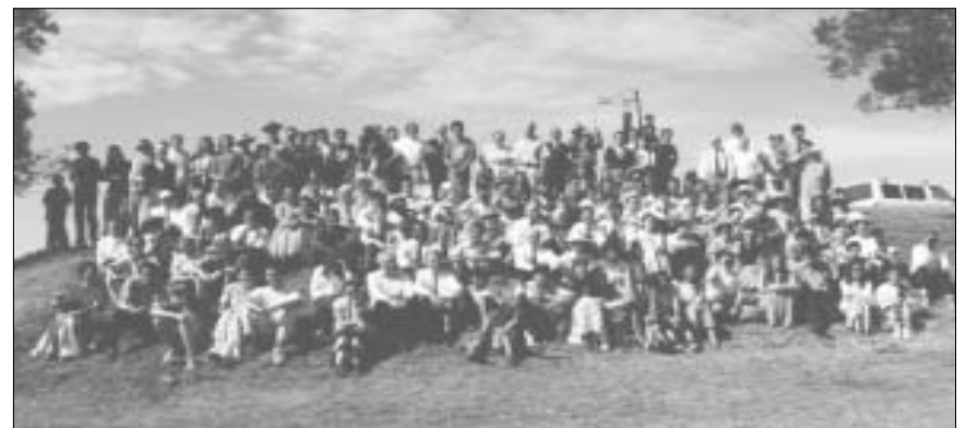
Attendees at the youth congress in Australia

Elim Heights Youth Camp has witnessed the gathering of many represen-