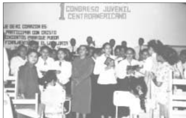
Choir from the church of Tegucigalpa